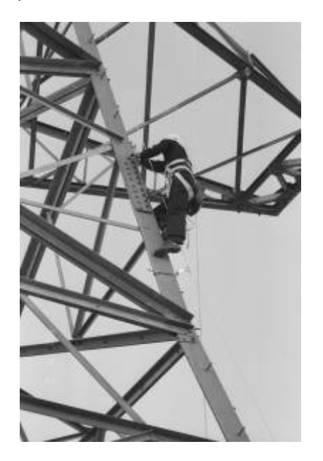
Primary support: ____ Fall protection: ____