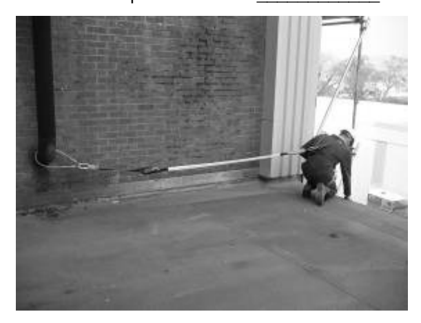
Primary support: ______Fall protection: