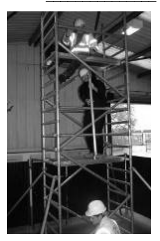
Primary support: Fall protection: