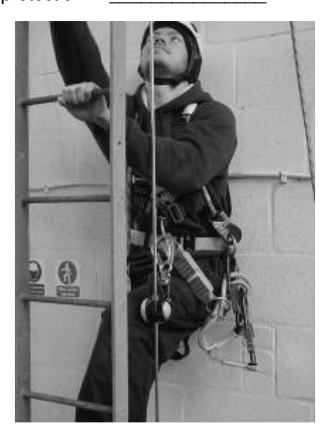
Primary support: ______Fall protection: