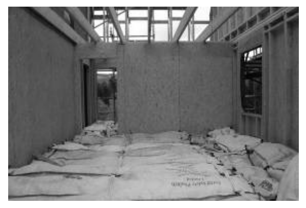
Primary support: ______Fall protection: _____