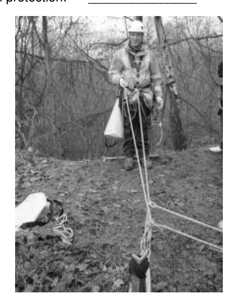
Primary support: ______Fall protection: