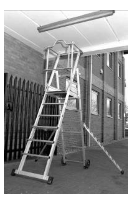
Primary support: _____Fall protection: _____