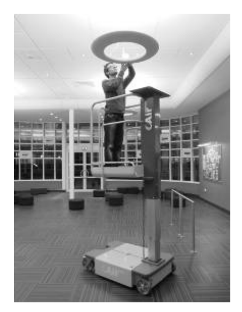
Primary support: ______Fall protection: