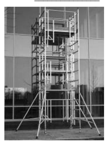
Primary support: Fall protection: