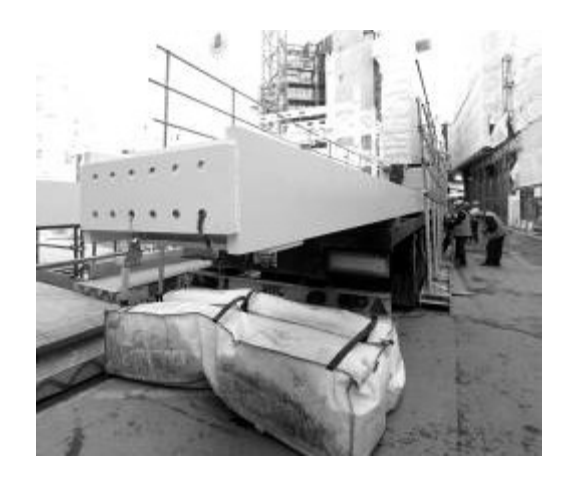
Primary support: Fall protection: