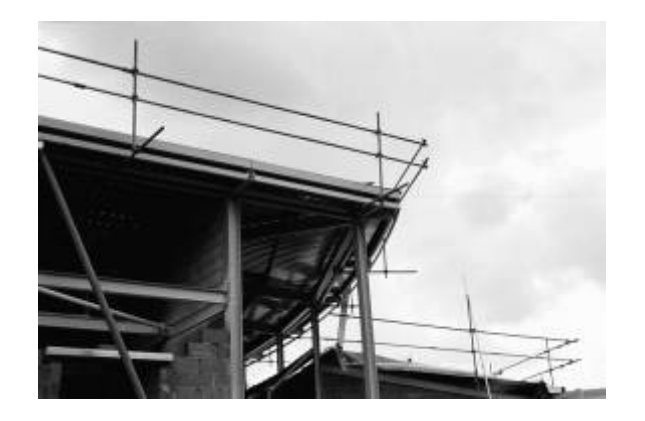
Primary support: _____ Fall protection: