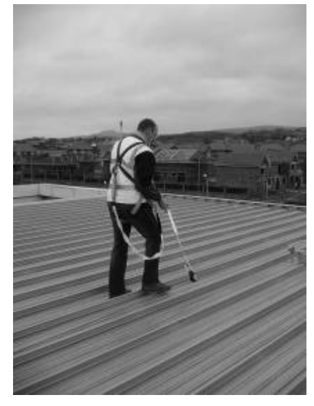
Primary support: ______Fall protection: