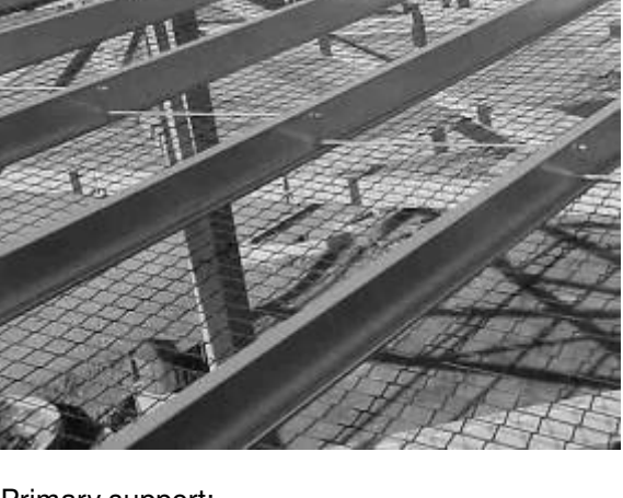
Primary support: ______Fall protection: