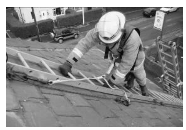
Primary support: ______Fall protection: