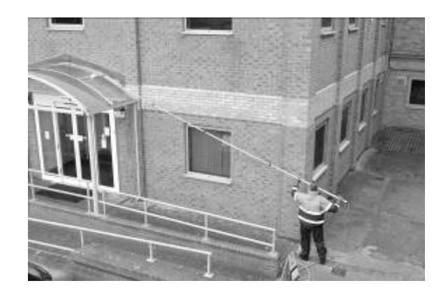
Primary support: ______Fall protection: