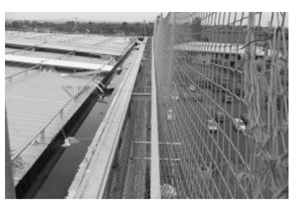
Primary support: _____ Fall protection: _____