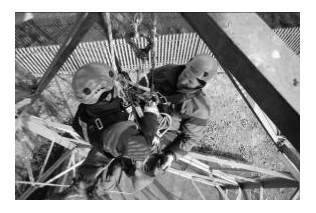
Primary support: ______Fall protection: _____