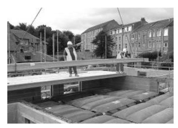
Primary support: Precast plank

Fall protection: Scaffold edge protection; Safety net below)